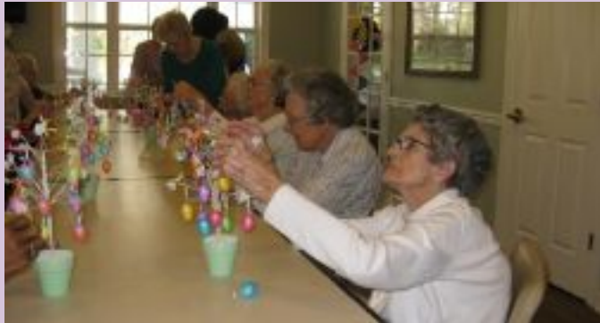
MAKING EASTER EGG TREES WITH HERITAGE GARDEN CLUB