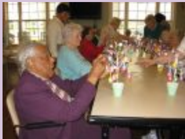
MAKING EASTER EGG TREES