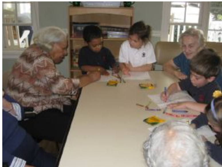
" NEVER TOO OLD TO PLAY "