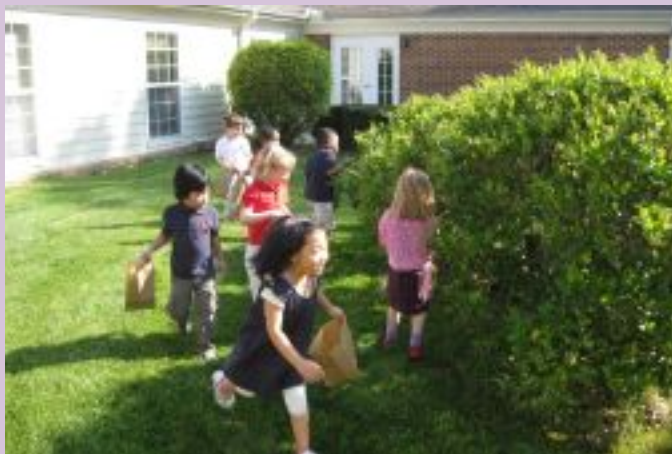
PRIMROSE PRESCHOOLERS HUNT EGGS