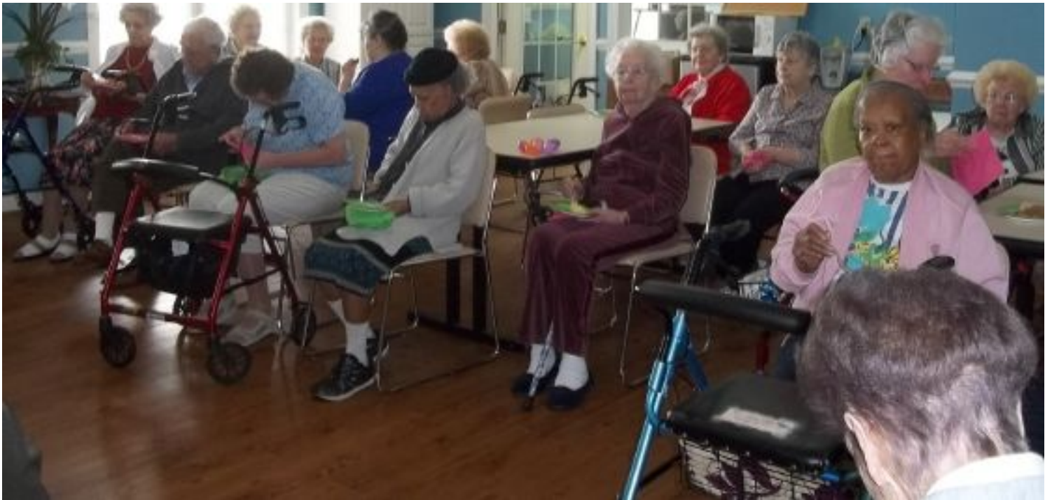
What a great turnout we had for our Easter Party! Guess we all needed some refueling after our Easter egg hunt.